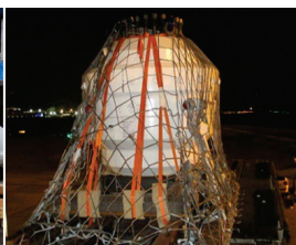
Oil & Gas